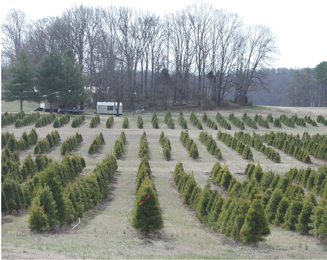
Four-year-old Virginia pine genetic test in the Piedmont (Salisbury) of North Carolina.